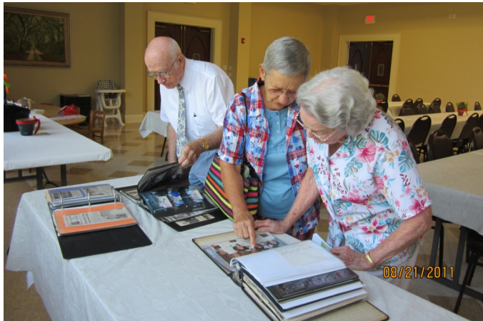
Members of the Senior Class look over mementos of past years at Wittenberg Sunday school.